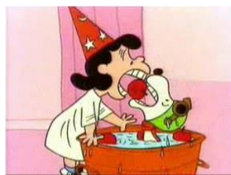
bobbing for apples